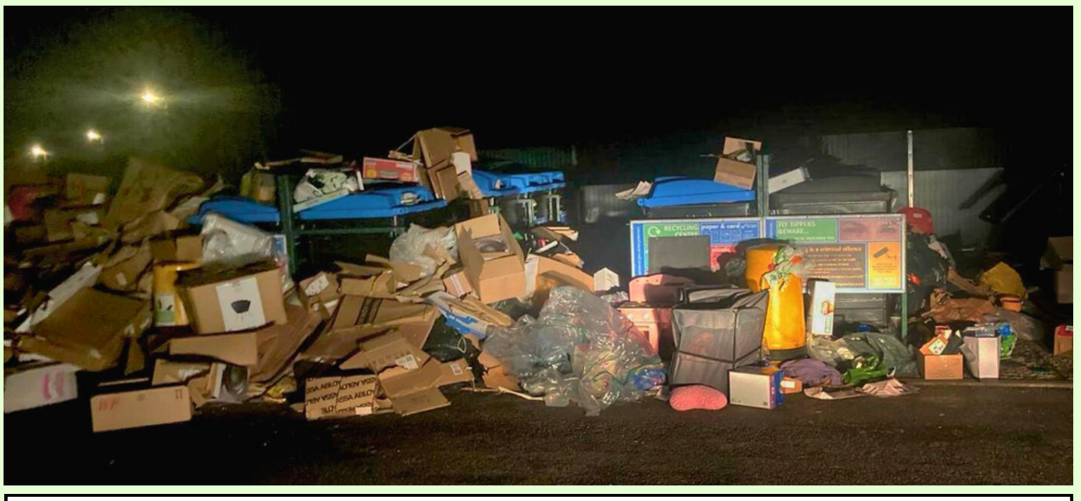
Sunday evening. Compare this to Sunday morning. Dumping continued after dark.