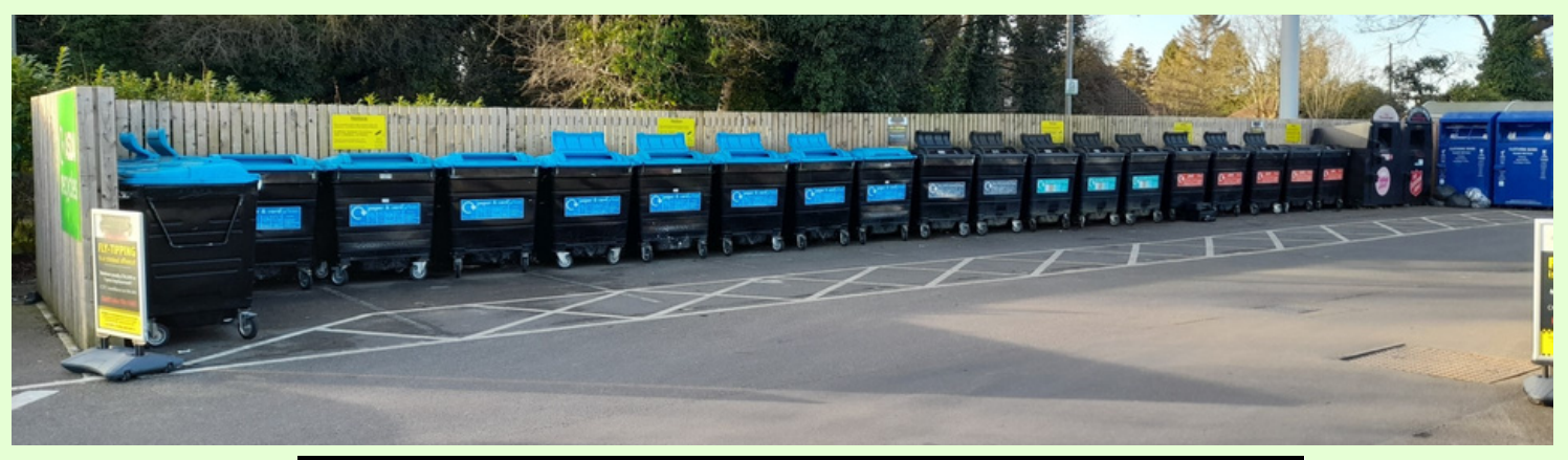
Above: Thursday Feb 1st. Below 1200 Monday Feb 5th.