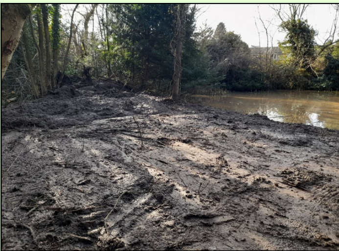
Lonesome Pond Long Walk Winter 2021/2022