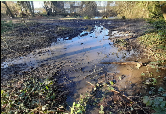
Lonesome Pond Chetwode Road Winter 2021/2022

Banstead Commons Conservators have a new website : bansteadcommons.org.uk