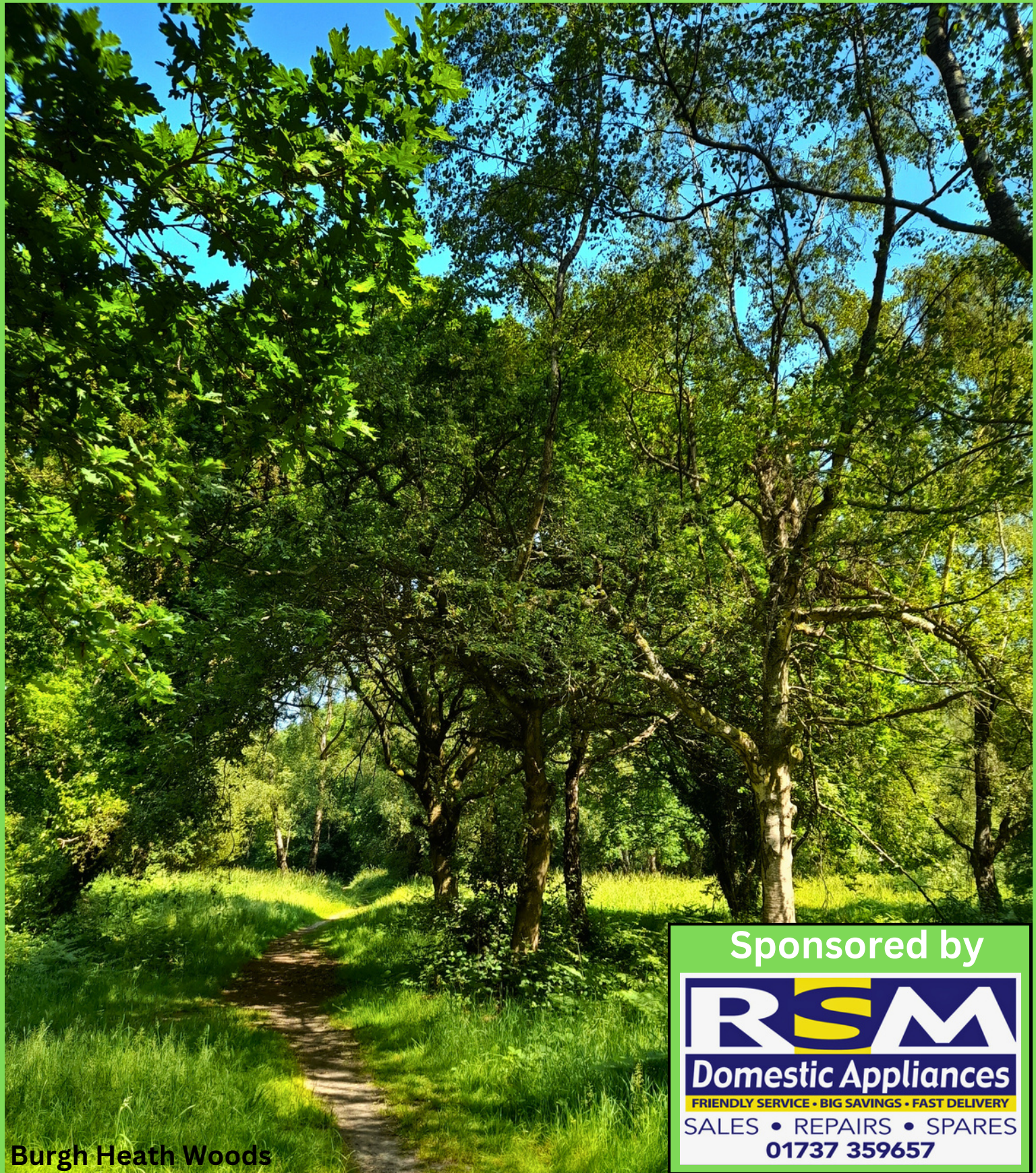
Burgh Heath Woods