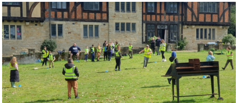
MYTI Club members at The Old Pheasantry