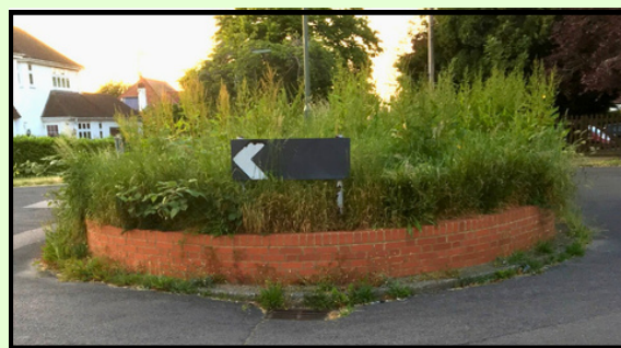
Sight lines dangerously obscured

At least the Leader of Surrey County Council has acknowledged this is not his finest hour and has set up Task Groups to find out what went wrong and how it can be fixed. Residents Association Councillors have put in a joint submission highlighting the failings and offering solutions. You can use the QR code to directly link to the County Council's website concerning their grass cutting, verges and weed management to submit complaints or problems.