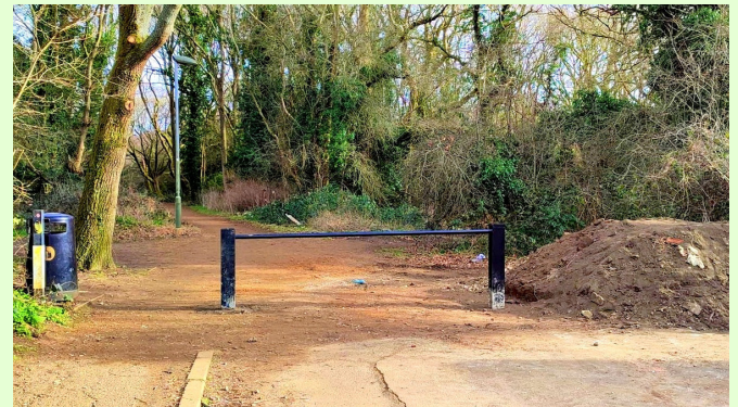
The new barrier now installed

Since the building of the path in 2015 from Chetwode Road to Reigate Road, both the path and the entrance have been the responsibility of the Reigate & Banstead Borough Council (RBBC). After this most recent illegal access, and two years since the problem was first highlighted by the Residents Association, the council has now installed a substantial barrier system to help secure the woods from intrusion by determined persons. In 2015 travellers entered the woods and after 8 days moved on leaving behind some tons of rubbish which cost over £10,000 to remove.