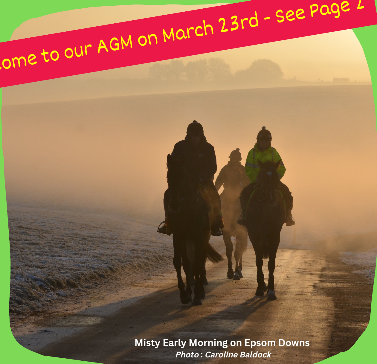
Misty Early Morning on Epsom Downs

Come to our AGM on March 23rd - see page 2