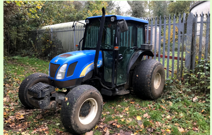
One of the tractors left in Burgh Heath

Over a period of three weeks around Christmas two stolen tractors and an agricultural quad bike were stolen and left in the Burgh Heath woods awaiting pickup by thieves. These woods are under the management of the Banstead Commons Conservators (BCC). The vehicles entered from Chetwode Road, the thieves simply removed the barriers which are supposed to prevent vehicle access. The image below shows the entrance after the first intrusion. Unfortunately the first tractor was moved on by the thieves before the police could be notified. The other two vehicles were recovered successfully.